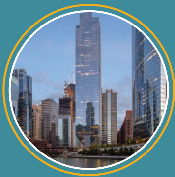
150 NORTH RIVERSIDE