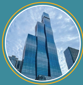
ST. REGIS CHICAGO