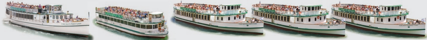
CHICAGO'S FIRST LADY 1991