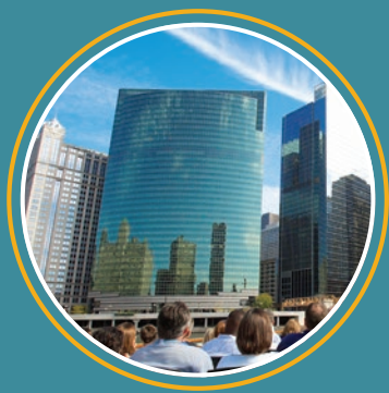
333 WEST WACKER