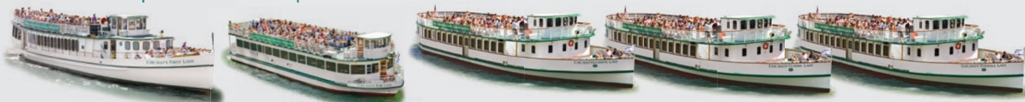
CHICAGO'S FIRST LADY 1991 CHICAGO'S FAIR LADY 2006 CHICAGO'S LEADING LADY 2011 CHICAGO'S CLASSIC LADY 2014 CHICAGO'S EMERALD LADY 2020