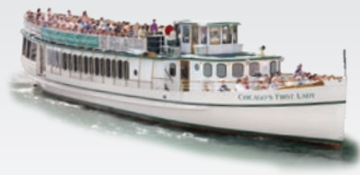
CHICAGO'S FIRST LADY