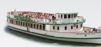
CHICAGO'S CLASSIC LADY