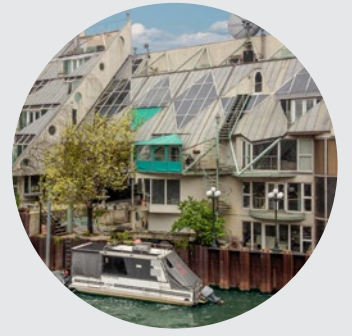
HARRY WEESE COTTAGES