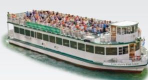
CHICAGO'S FAIR LADY