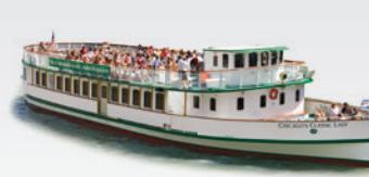
CHICAGO'S CLASSIC LADY