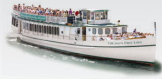
CHICAGO'S FIRST LADY