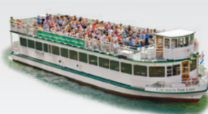
CHICAGO'S FAIR LADY