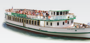
CHICAGO'S LEADING LADY