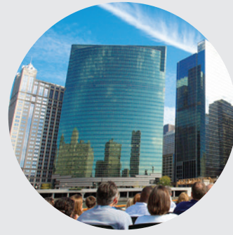
333 WEST WACKER