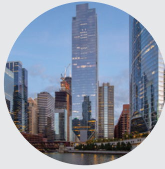
150 NORTH RIVERSIDE