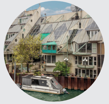
HARRY WEESE COTTAGES