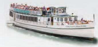
CHICAGO'S FIRST LADY