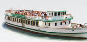
CHICAGO'S LEADING LADY