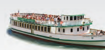
CHICAGO'S EMERALD LADY