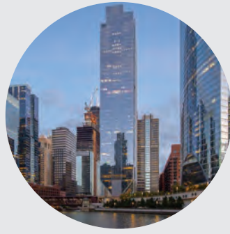
150 NORTH RIVERSIDE