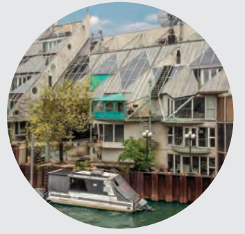
HARRY WEESE COTTAGES