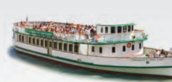
CHICAGO'S CLASSIC LADY