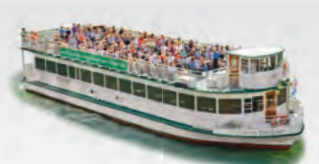
CHICAGO'S FAIR LADY