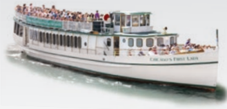
CHICAGO'S FIRST LADY