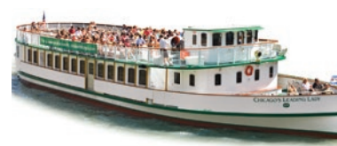
CHICAGO'S LEADING LADY