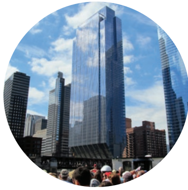
150 NORTH RIVERSIDE