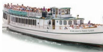
CHICAGO'S FIRST LADY

Enjoy our popular tour in the early morning light. The vessel pauses at three picturesque points allowing you to capture that perfect shot!