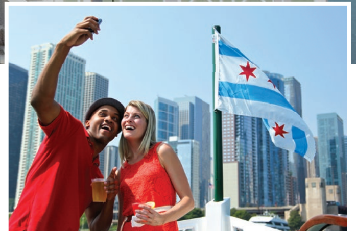
VISIT THE BAR! Snacks, beer, wine, cocktails, lemonade and soft drinks are available for purchase anytime during your cruise.

Get your tickets now at Ticketmaster.com/RiverCruise or call 1-800-982-2787