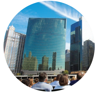
333 WEST WACKER