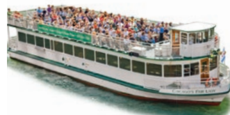
CHICAGO'S FAIR LADY