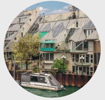
HARRY WEESE COTTAGES