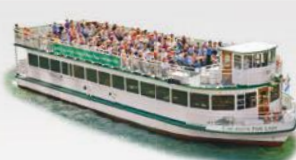
CHICAGO'S FAIR LADY