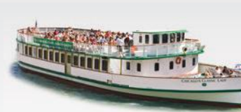
CHICAGO'S CLASSIC LADY