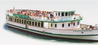
CHICAGO'S LEADING LADY