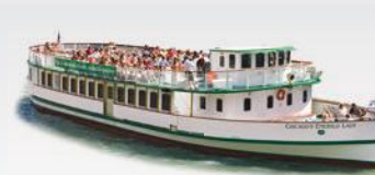
CHICAGO'S EMERALD LADY