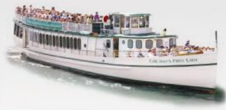
CHICAGO'S FIRST LADY