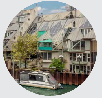
HARRY WEESE COTTAGES