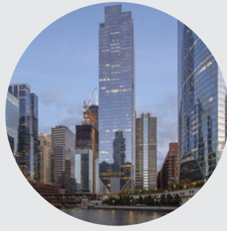
150 NORTH RIVERSIDE