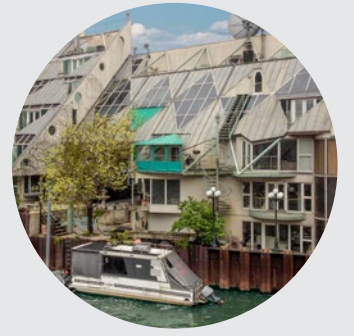
HARRY WEESE COTTAGES