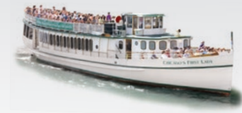
CHICAGO'S FIRST LADY