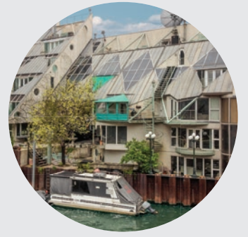
HARRY WEESE COTTAGES