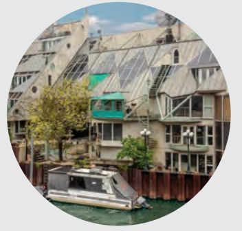
HARRY WEESE COTTAGES