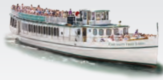
CHICAGO'S FIRST LADY