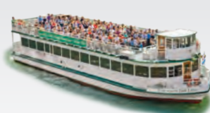
CHICAGO'S FAIR LADY