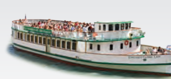
CHICAGO'S CLASSIC LADY