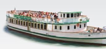
CHICAGO'S LEADING LADY